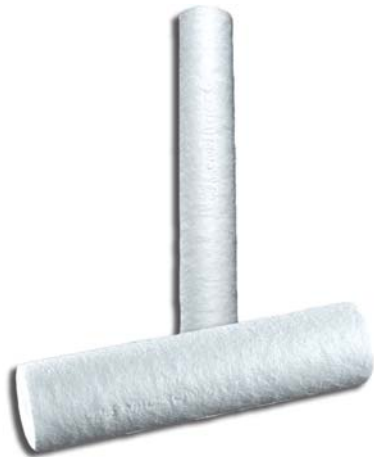
Figure 1: Purtrex Depth Cartridge Filters